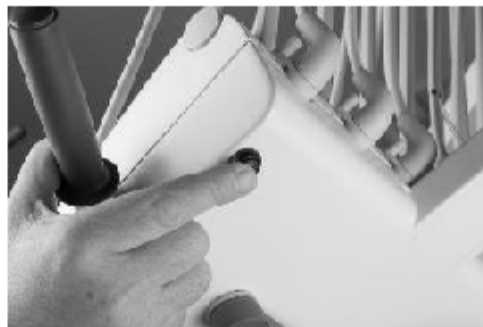
Figure 65 – Configuration button (1) under the instrument bridge